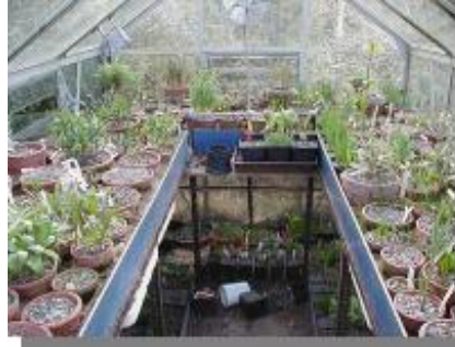
Ian Young's Weekly Bulblog